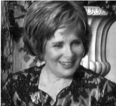
Carole Wald Tzorchei Tzibur Award 2011